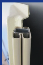
Strong Metal Wall Columns and Roof Support