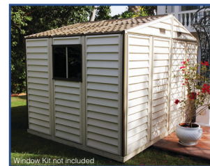
Roof Top View