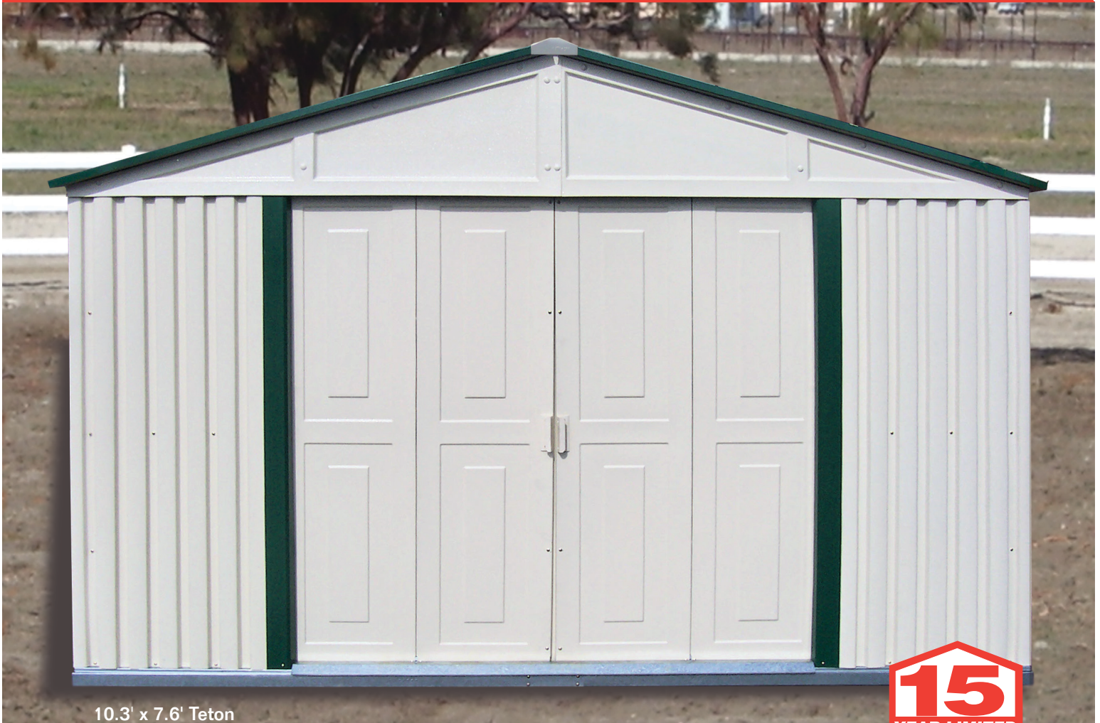
10.3' x 7.6' Teton