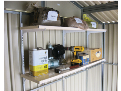
Products on the shelves are not included