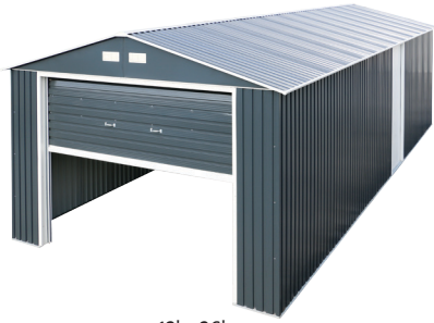
12' x 26'