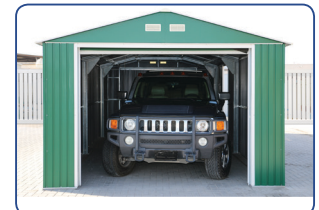
Available also in Green with Off White Trim & Off White with Brown Trim