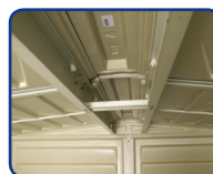
Strong Steel Roof Truss Carries 20 lbs/sqft Snow Load