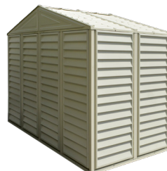
Back Angle View