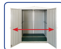
Wide & Tall Single or Double Doors