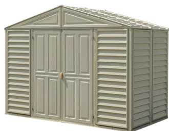
Front Angle View

This tall walk in shed features tall and wide double doors. The wall columns are reinforced with a solid metal structure that gives the shed strength and allows you to hang shelves or garden tools. These can also be used as a hobby or activity room.