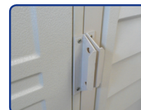
Door Handles with Padlock Eyes

When is a shed more than just a shed, our 10' x 5' Woodbridge 5 will be perfect adjacent to the side of a house or fence or garden for extra storage space.